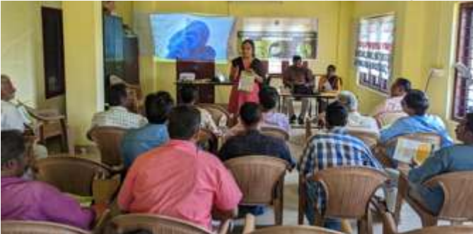
Dignitary speaking during the quality improvement training programme on Small Cardamom