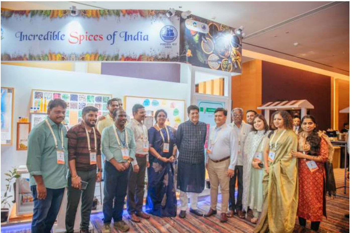
Officials of Spices Board with Shri Piyush Goyal, Minister of Commerce and Industry, Consumer Affairs, Food & Public Distribution, and Textiles

Addressing the meeting, MoS (Finance), Dr Karad highlighted the widening gap between developing and developed countries, which further gets exacerbated during pandemics and geopolitical crises. Emphasizing on the need for efficient and resilient global supply chains, he expressed that the G20 member countries must collaborate in designing interventions that will diversify GVCs in critical sectors, such as food, fertilizers, energy and pharmaceuticals.