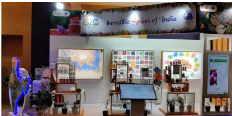
Theme based experience zone on spices set up by Spices Board

spices sector. The experience zone recapitulated an impression and feel in the minds of the visitors and onlookers, which complimented to creating a sustainable brand image to Indian spices as premium products of desired quality, food safety and hygiene aspects, having applications in various sectors. The experience centre also had a digital zone where all necessary information on Indian spices were made available in a digital format.