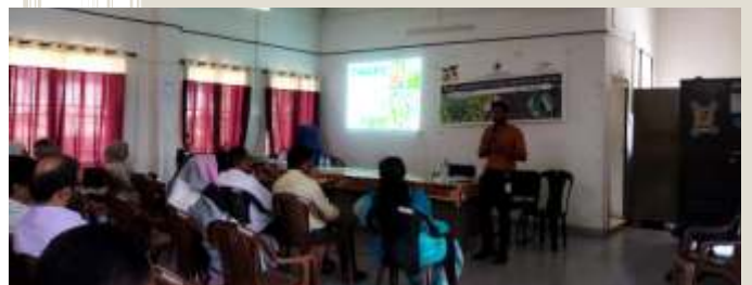
Dignitary speaking at the Quality Improvement Training Programme