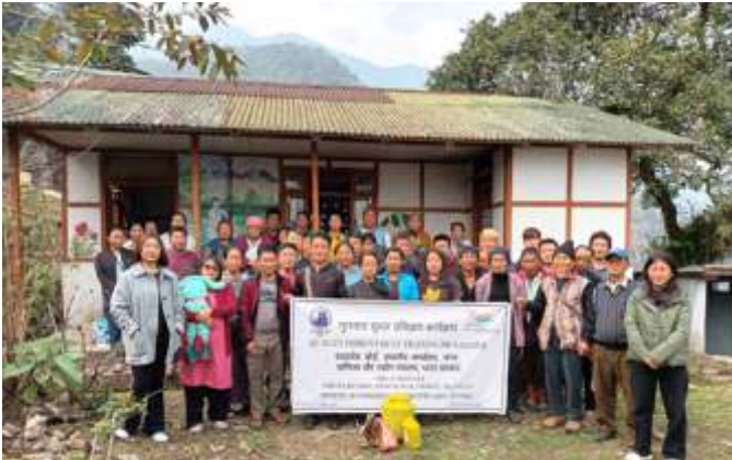
Participants after the quality improvement training programme

Spices Board Divisional Office, Mangan, Sikkim conducted a quality improvement training programme at Taryang village, Sikkim on 02 March 2023.