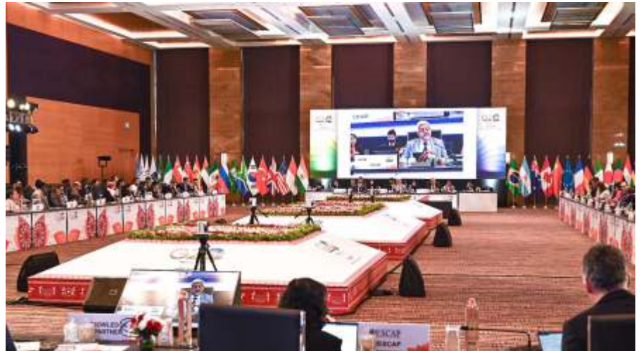
Delegates from G20 countries and other invitees attending the G20 Trade and Investment Working Group Meeting

The spices experience zone sought to provide a holistic experience to position Indian spices as of high-quality and meeting the norms of food safety in addition to demonstrating the country's strength and capabilities in the