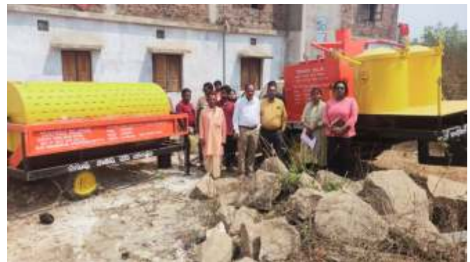
Officials of Spices Board along with farmers near the newly supplied machineries

Spices Board Field Office, Koraput, Odisha supplied turmeric boiler and polishers for the first time under QGBG scheme to two FPOs; Vikas Jyoti FPO and Baishnab Kandhamal Vegetables and Spices FPO in Kandhamal district. As the machineries were very new to the tribal farmers, a demonstration on the usage of the same was done by the manufacturers during the final inspection of the machineries.