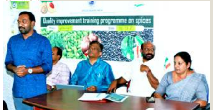
Dignitaries during the Quality Improvement Training Programme on Nutmeg