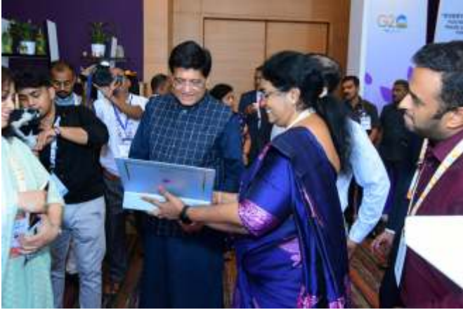
Hon'ble Minister of Commerce & Industry, Consumer Affairs, Food and Public Distribution, and Textiles, Shri Piyush Goyal appraises the spices gift box

Shri Sunil Barthwal, Secretary, Department of Commerce and Chair for the TIWG Meeting reiterated that under Indian Presidency, the aim of the G20 member countries is to achieve shared outcomes for making growth inclusive and resilient, increasing the participation of developing countries and the Global South in GVCs, and building resilient GVCs to withstand future shocks. He added that the Presidency aims to develop inclusive trade policies that support global prosperity, guided by the principle of "One Earth, One Family and One Future", where cooperation and collaboration amongst nations will be the key drivers for promoting growth, and reducing poverty and inequality.